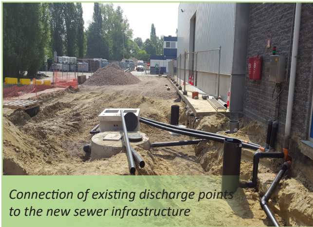
Connection of existing discharge points to the new sewer infrastructure

The complexity of this project was determined by a number of elements. For example, a phased erection was required in the first place to avoid hinderance of the production activities. The complicated existing underground situation also created an extra level of difficulty in which the continuity of all functions had to be ensured at all times.