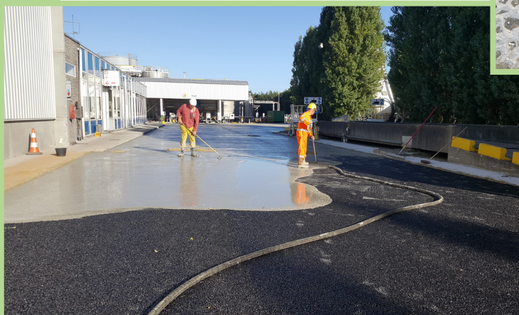
Realization of 4000 m 3 of asphalt with oil-resistant top layer